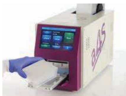
A4S Fully Automated