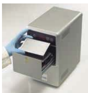
4s3 Semi Automated