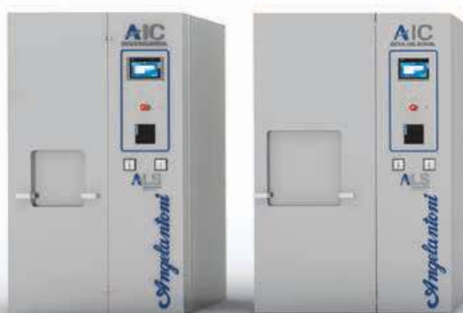
Series LAB 1.80 HSD Series LAB 1.100 HSD